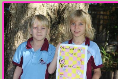
CLASSIEST CLASS: Gaagal