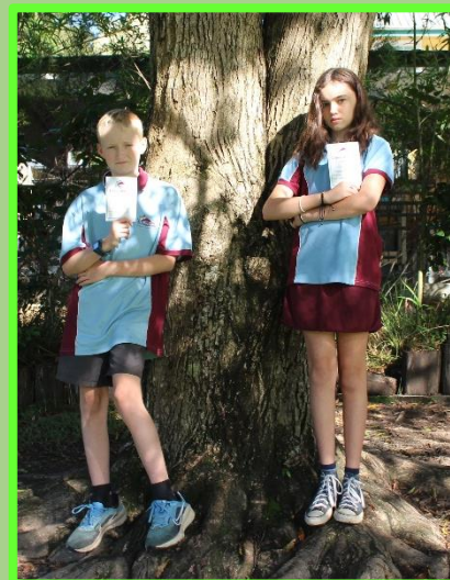
WINDA: Brax & Wren