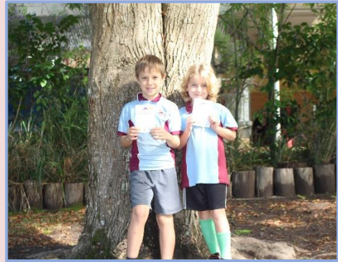
JULUUM: Reef & Didi