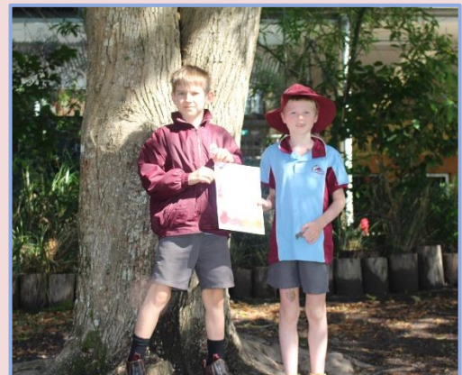
CLASSIEST CLASS: Julum