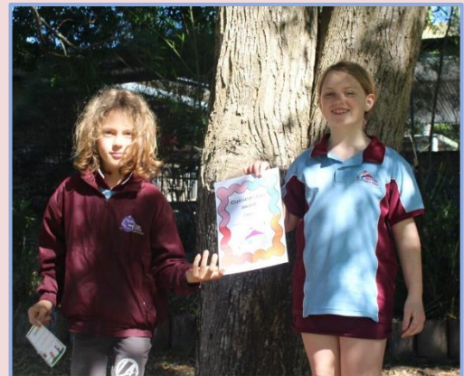
CLASSIEST CLASS: Bindarray