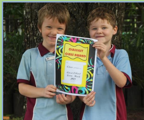
CLASSIEST CLASS: Gaagal