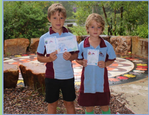
JULUUM: Reef & Didi