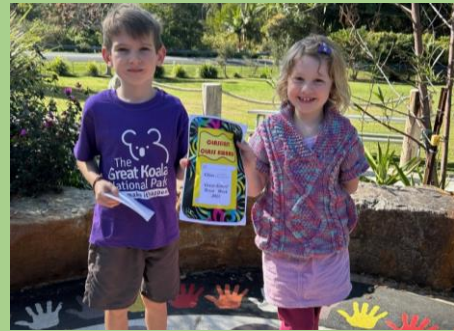
CLASSIEST CLASS AWARD: Gaagal