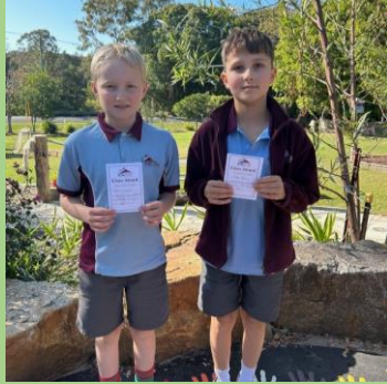
BINDARRAY WINDALA: Brax, Kale