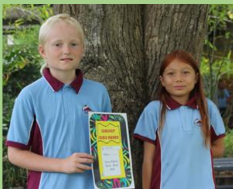
CLASSIEST CLASS AWARD: Bindaraay