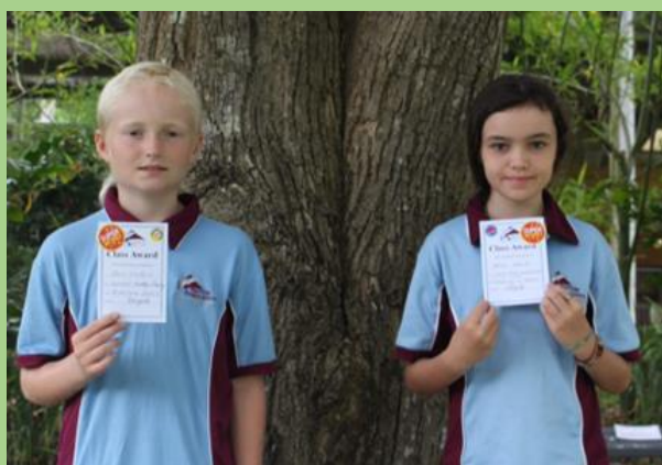
BINDARRAY: Brax, Wren