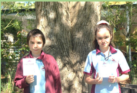
BINDARRAY WINDALA: Elwood & Wren