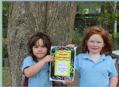
CLASSIEST CLASS AWARD: Gaagal