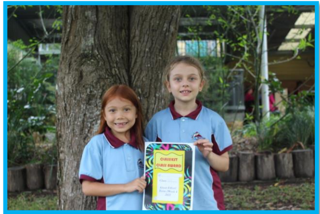
Classiest Class Award – Bindarray