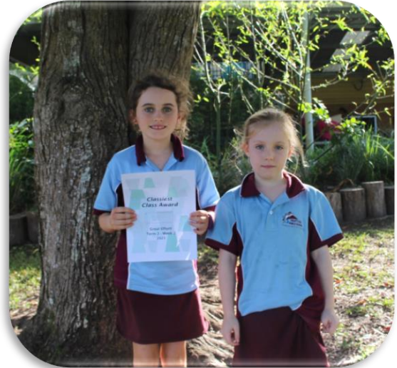
Classiest Class Award – Bindarray