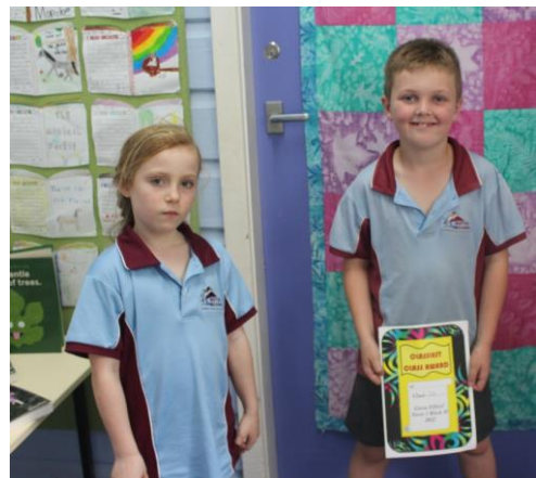
Classiest Class Award – 2/3