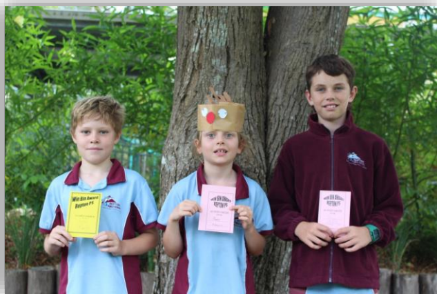
Win Bin Award