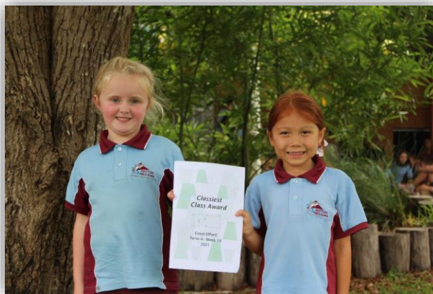
Classiest Class Award K/1