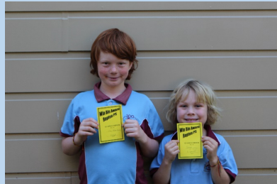
Win Bin Awards Oro & Sage