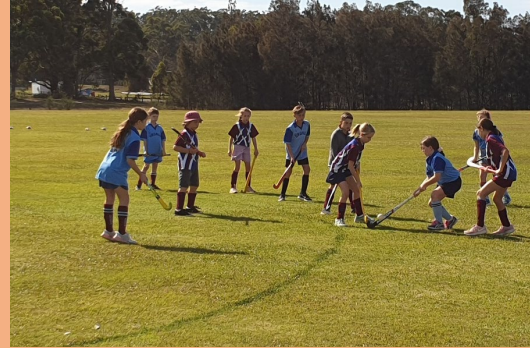
Hockey Gala Day

Yesterday, Tuesday 30 th July, Repton went to the hockey gala day in Coffs Harbour along with Narranga, Raleigh, Urunga and other schools. We had two stage 2 teams and a stage 3 team which both played at the start of the day, versing different teams.