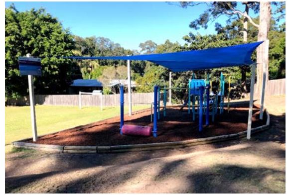
The playground has had a makeover