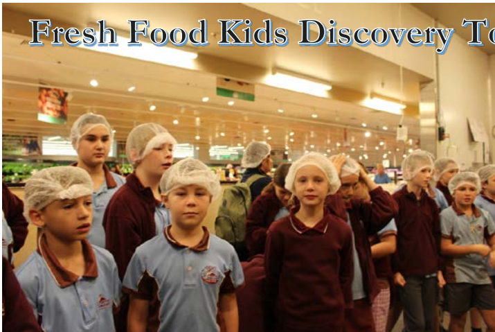
Fresh Food Kids Discovery Tour