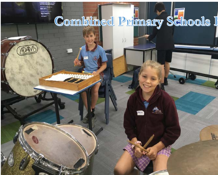
Combined Primary Schools Band Workshop