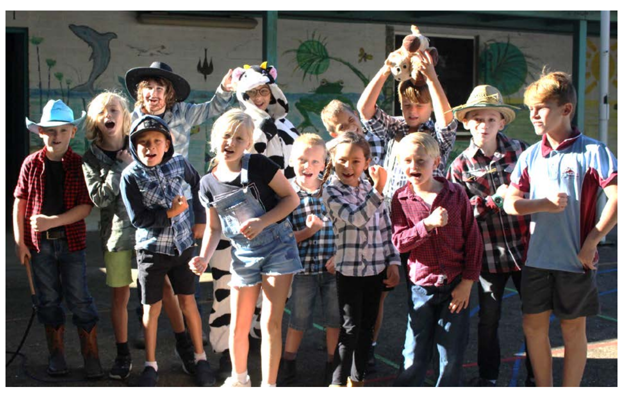
It's back! Woolworths earn& learn