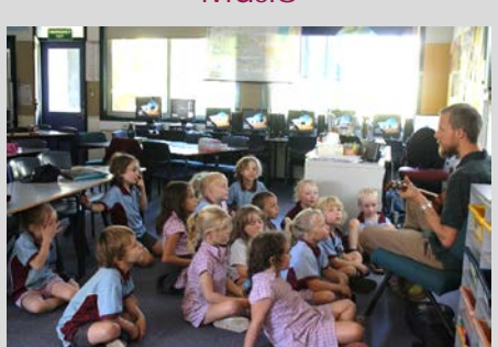
K/1 are seen here singing along to 'Our Sun'. They were able to sing along to the whole song this week. Well done K/1!