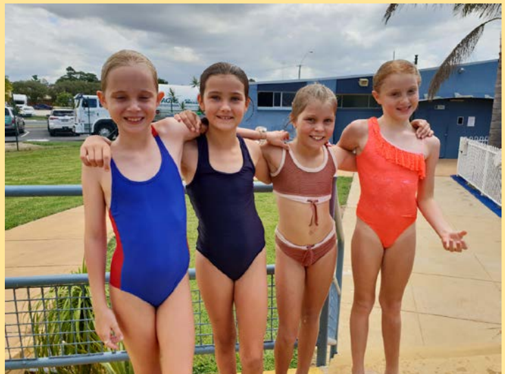
Junior girls relay team after their event