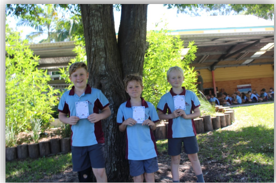
Classiest Class – 2/3/4